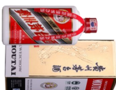
Double Gold, World Spirit Comp '14

The nose of this wine displays a mix of white stonefruits and pineapple with an underlying hint of ginger. The palate is luscious and flavoursome with notes of nectarine and peach with a twist of candied citrus rind. These sweet flavours evolve through the palate into more savoury flavours reminiscent of raw almonds and spice.